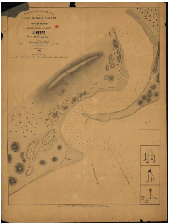
The dunes at the mouth of the Limpopo River. These dunes constituted the first dune area that the Portuguese tried to stabilize in Mozambique. Map produced by the Comissão de Cartografia, 1894. Public Domain. Courtesy of the Portuguese National Library.

Depending on the perspective, these stories of humans and dunes can be seen either as disasters or examples of resilience and ingenuity. Some question the relevance of this old knowledge. "Obsolete," they call it. But it isn't. In the twentieth century, dunes were repeatedly destroyed, eliminated as a nuisance or as the cost of development of the cities and resorts that were built along the coast. It was not until the mid-1950s that scientists realized their key role as buffer areas and rediscovered the strategies long used by coastal communities.