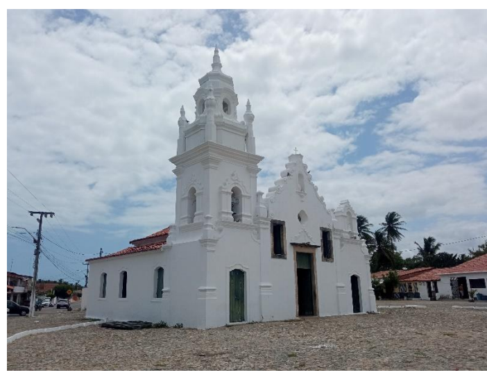
Almofala, Ceará, Brazil. This church was once buried by the sand dunes but was later uncovered by the locals. Photo by Joana Gaspar de Freitags. <u>CC BY 4.0</u>.

Writing dune history turned out to be easier said than done, for it led to some methodological challenges. Historians turn people's messy lives and past events into histories with meaning. On the other hand, environmental history is full of well-