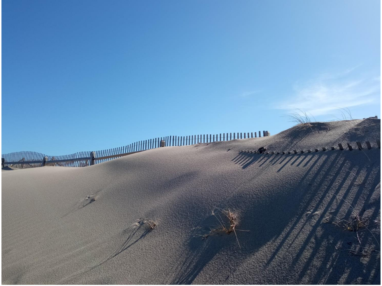
Dunes: the beauty of geopoetry. Photo by Joana Gaspar de Freitas. CC BY 4.0.

Sand, solid, substance From high mountains with valleys and vineyards Down the river to the sea. Washed ashore, Blown by cold northwest winds, Trapped by the roots of the marram grass. Slowly piling and growing, flowing and being Dune, story, dream.