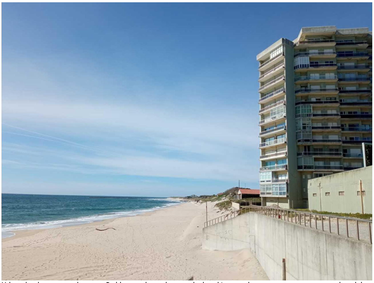
Urban development on the coast. Building on dunes destroys the beach's natural protections, increasing its vulnerability to coastal erosion. Ofir Towers, Portugal.

The dunes are my muses. In the process of acknowledging them, I became a different historian, and someone who sometimes would like to be a poet. For dunes are transient environments; when writing about them, I often felt the insanity of trying to nail down sand with words. How does one describe an entity that never stands still? Dunes have no place of their own, no flesh, no boundaries; they are a collective of substances, creatures, and forces that came from other places and belong to other worlds, so perfectly aligned that they can be considered geopoetry.