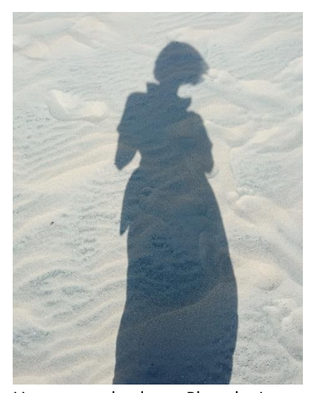
Historian in the dunes.

After all, readers are human, too. I would reach them by acknowledging and reflecting on what life and the dunes are made of, by unfolding the human experience of the dunes, by peeling off the many layers of the encounters between people and sand that I uncover through my inquiries and findings. As a historian, I'm bound to the truth, but I could also bring creativity and emotion to the pages, making readers feel the dunes, taking them on visits to my beaches, using the power of narrative and the rhythm of poetry.<sup>3</sup>