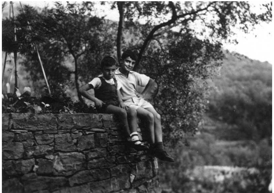
Italo Calvino and his younger brother Floriano, June 1933.

Much has been written about The Baron in the Trees , a wonderful novel for its inspiration, its linguistic richness, and the way the author, then only 34 years of age, manages to render historical, scientific, and philosophical complexity with a deft touch. The content is effervescent and unpredictable; it reads like a fable and can be interpreted in various ways: as Calvino's reaction to the ancien régime of the Italian Communist Party (PCI), which supported the USSR's violent response to Hungarian students demanding freedom; or as a utopia, expressed in the dream of a boy who refuses to set foot on earth and cultivates a radical political project that includes trees and other plants, domesticated and wild animals, and all humans. The Baron is all of this, but more too, especially when read through the lens of the environment.