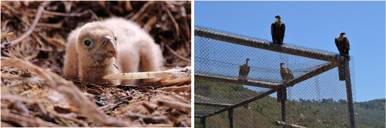
Fig. 3. (Left) A griffon vulture chick. (Right) Griffon vultures on top of their special training cage in the Carmel Mountains, Palestine-Israel.

There are currently 220 vultures in Palestine-Israel. They are intensively managed using various forms of digital conservation. The chief ornithologist for Israel's Nature and Parks Authority told me accordingly: "I cannot think of any other animal on this planet with such high monitoring rates. We have about 80 percent monitored by GPS and 75 percent of the vultures are tagged, meaning we know their history and we also [genetically] sample each one." 13 Through this digital monitoring, an enormous body of data is accumulated about the vulture's location, body temperature, and movement. Specifically, acceleration data that identifies movement is analyzed to extract nuanced information about vulture behavior. This type of study is situated within the field of movement ecology, which promotes an understanding of movement patterns and their role in various ecological and evolutionary processes. Such complex conservation projects necessitate engagement with computer science, paradoxically distancing biologists from the very sites and materialities of their research. The alienation that occurs with such conservation management by algorithm highlights that "digital data enables and encourages the automation of conservation decisions." 14