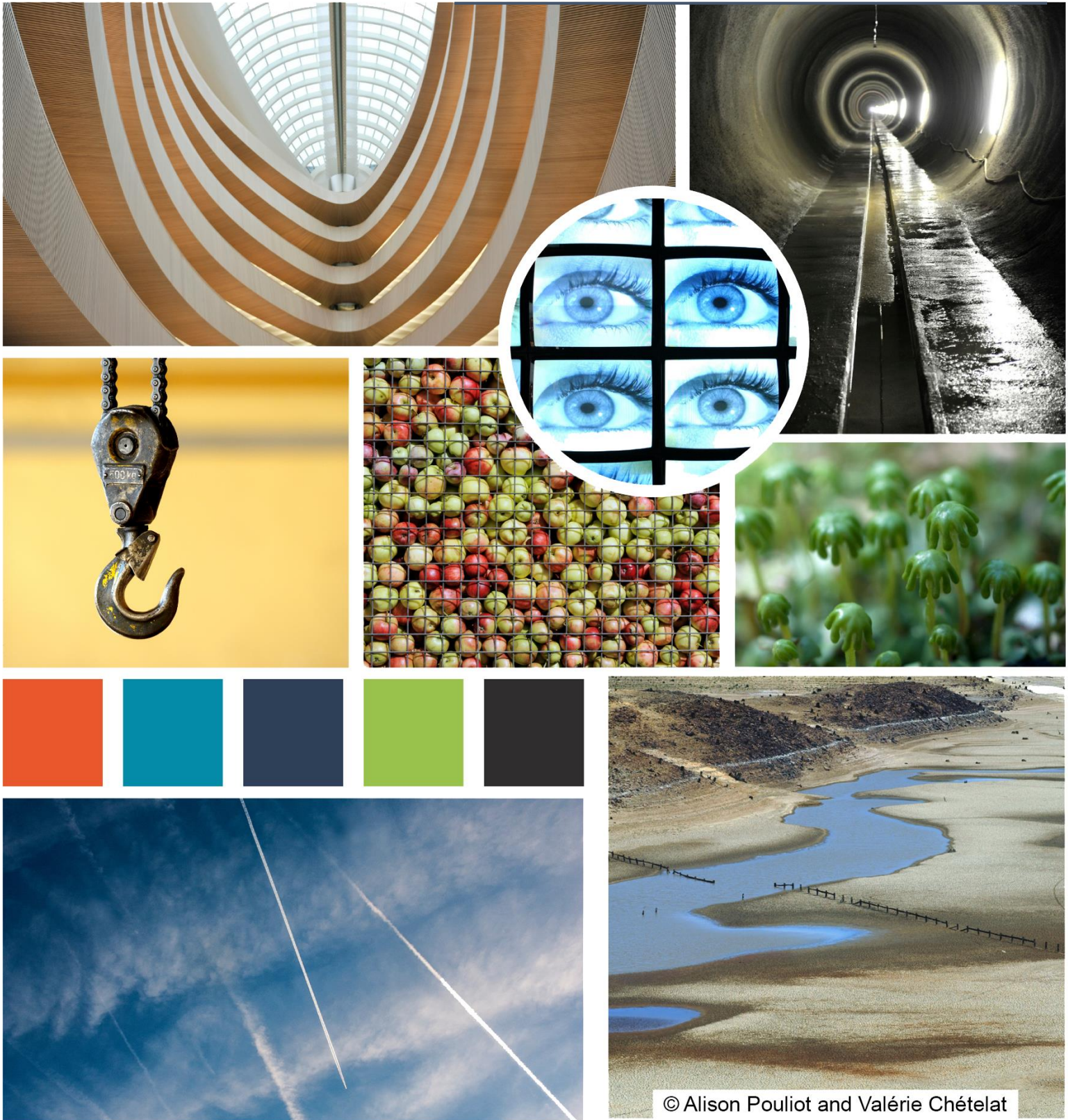
© Alison Pouliot and Valérie Chételat