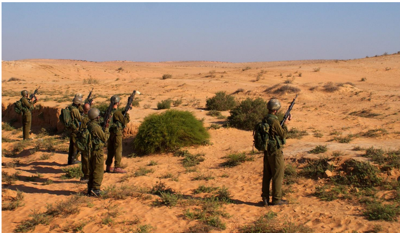
Fig. 1. Israeli soldiers exercise in a desert.

In July 2020, Israeli television reported on an endangered griffon vulture ( Gyps fulvus ) chick who had lost his mother to electricity wires. As would soon become clear, the chick's father was unable to provide enough food to ensure his son's survival. The Israeli army, referred to by most Israelis as the Israel Defense Forces (IDF for short, or Tsahal in Hebrew), readily stepped in, using a state-of-the-art drone technology to drop daily offerings of rat food for the chick by deftly managing the intense cliffs. "Mother drone," as the army referred to this technology, was blurred in the video that documented the operation. It had to be, the reporter explained, because it "belongs to the Israeli army and is classified as top secret." Standing with his back to the camera, the military general in command told the reporter about the countless hours spent practicing the delivery on a mock-up of the ledge and nest before the military started food drops for real. The report ended with the following statement: "The collaboration between a tech company, the military, and conservationists got the ultimate endorsement this week when the chick flew for the first time. Job [well] done!" (Figure 2). 1