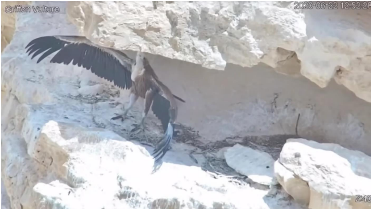
Fig. 2. After his mother died by electrocution, an endangered vulture chick is fed by "Mother drone," an advanced technology operated by the Israeli army.

This three-minute news item encapsulates the three-way dance between conservation, digital technology, and the Israeli army. The blurred classified drone, the obscured military general, and the three men—from high tech, conservation, and the military—congratulating themselves on their mothering skills, all occurred at one of the most visited national parks in Palestine-Israel, Ein Avdat in the southern Naqab-Negev desert, and was broadcasted live to the Israeli public via a 24/7 camera installation. This was not the first, nor would it be the last, collaboration between Israeli conservationists and the army.