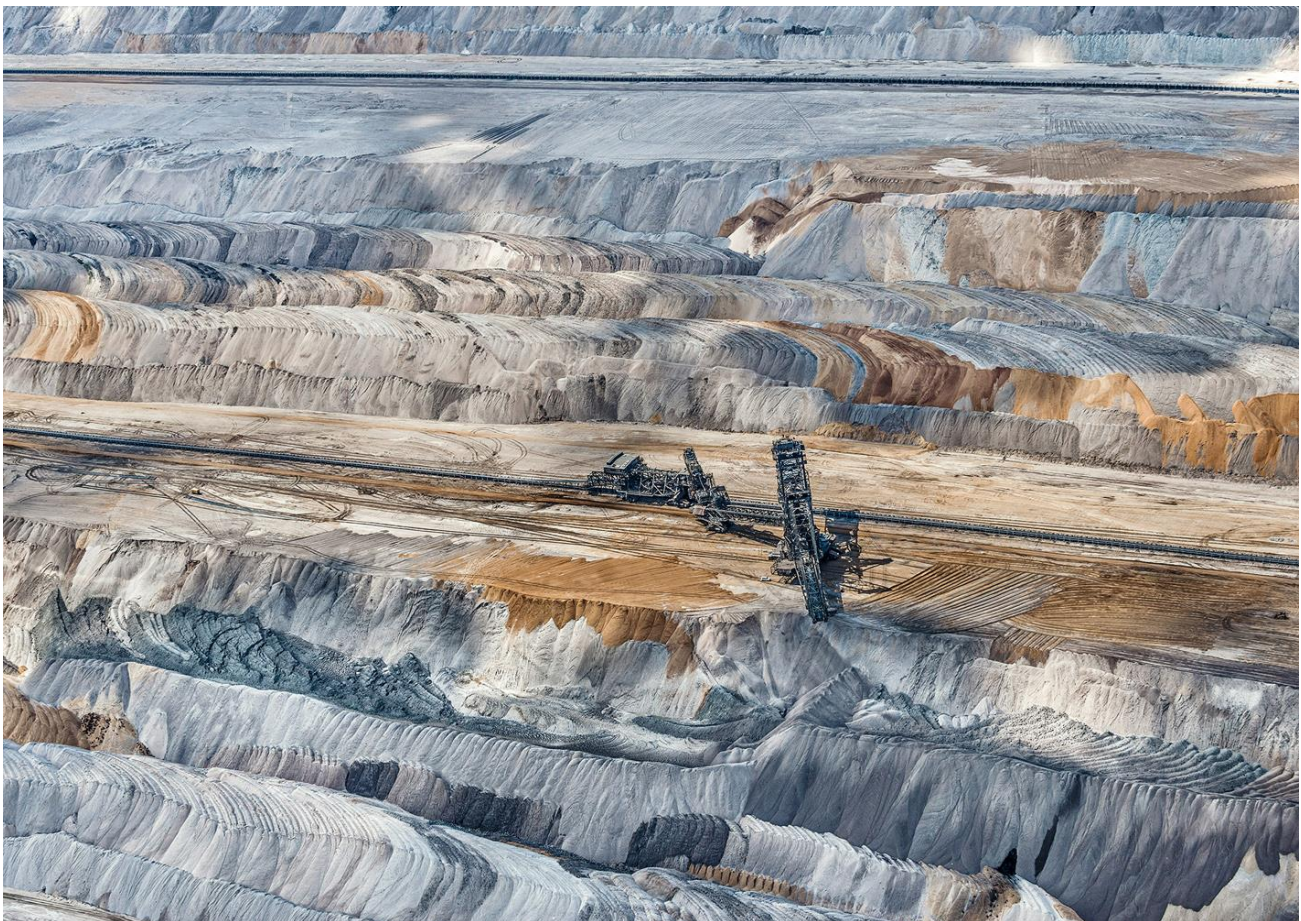
Open-pit coal mine, Hambach, Germany.