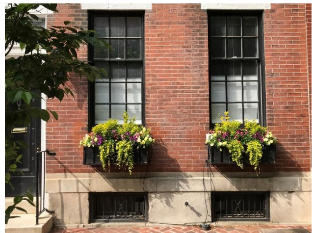
(Left) Community gardens, Philadelphia, 2004. (Right) Window boxes, Philadelphia. All rights reserved.