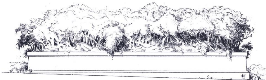
Design, Parc Henri Matisse, Lille. © Agence Empreinte, Lille. All rights reserved. This image has been cropped.

SD: The design of our built environment, which includes open spaces of various types, including private gardens, allotment gardens, public parks, plant nurseries, streets, parking lots, and plazas, both reflects and shapes power relationships. This has always been the case and still holds true today. Which ideologies or ideas are guiding depends on time and place, of course, and on the respective political, social, and cultural context. One idea that has been gaining traction in parts of Europe and North America is the recognition of the value of spontaneous vegetation. Concerns about climate change and biodiversity loss, on the one hand, and budget cuts to departments of parks and recreation, which result from the neoliberalization of urban economies, on the other, are rendering the idea of a wilderness aesthetic more popular in some urban areas. Notable examples for designs that have worked with spontaneous plant growth are Berlin's Park am Gleisdreieck and Parc Henri Matisse in Lille.