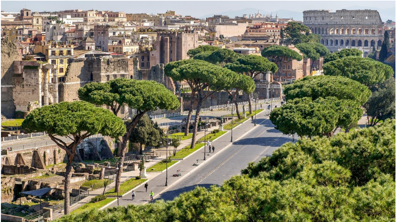
Pine trees in Rome, planted to replace other tree species in the 1920s and '30s.

PK: Which ideological connotations accompany the designs of parks and public gardens today?