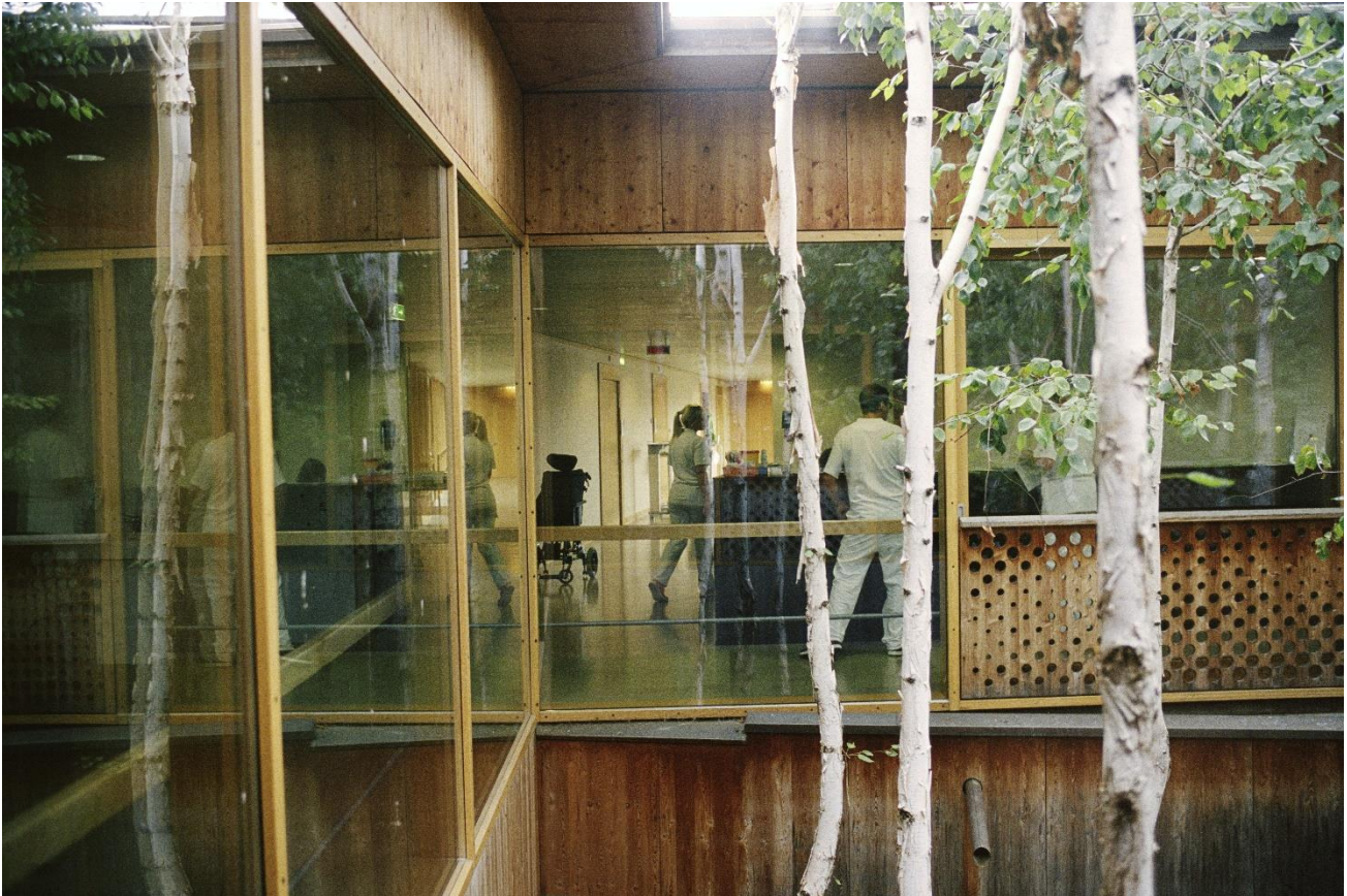
Clinic for Neurohabilitation and Paraplegiology, Basel, Switzerland.

PK: In your research, you repeatedly address the intersections of power and plant cultivation. As you write in the edited volume A Cultural History of Gardens in the Age of Empire (Bloomsbury, 2013), nineteenth and twentieth-century rulers constructed parks and gardens as symbols of power. What was it about the gardens that impressed and conveyed such power?