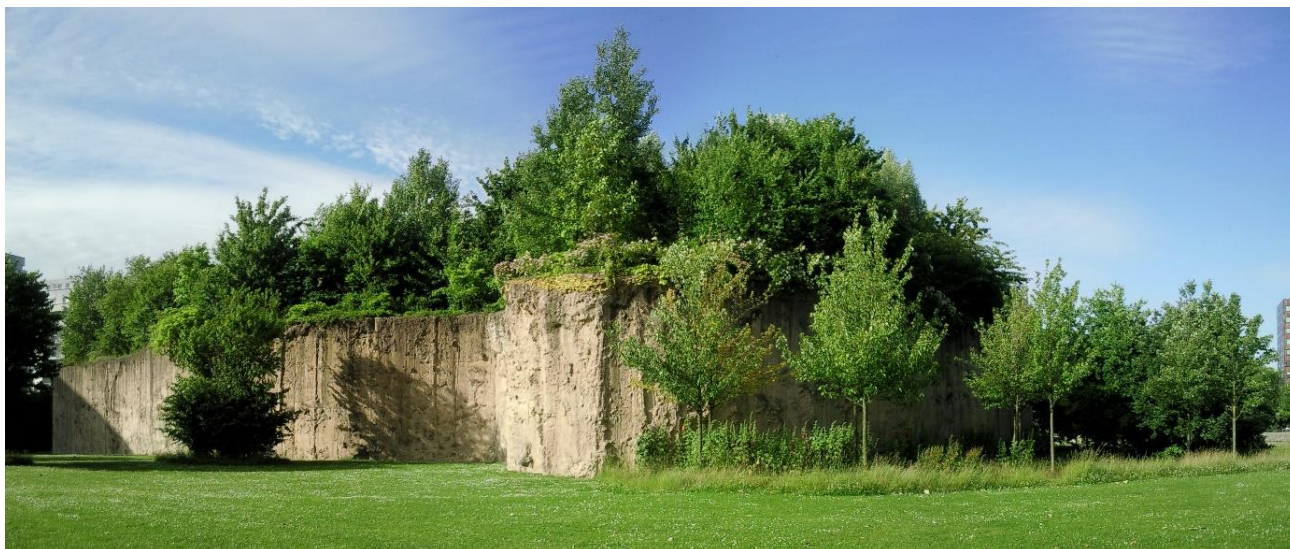
Parc Henri Matisse, Lille.

PK: When it comes to state ideologies and the values and beliefs that have been manifest in greening projects, we are facing a double-edged sword: in the past, nationalist beliefs were expressed through “natural” gardens that would promote “wild” plants. What do you make of this ideological heritage?