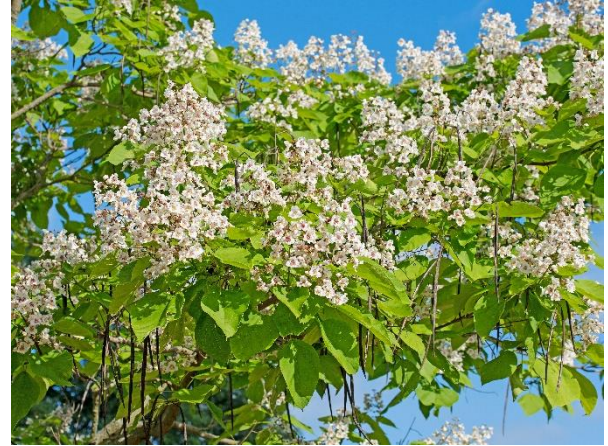
(Left) Montpellier maple ( Acer monspessulanum ). (Right) Southern catalpa ( Catalpa bignonioides ).

PK: Your work highlights the immaterial value of plants, and trees more specifically—their beauty, the stories they tell, and the psychological effects they can have on humans. What kinds of psychological effects are you referring to?