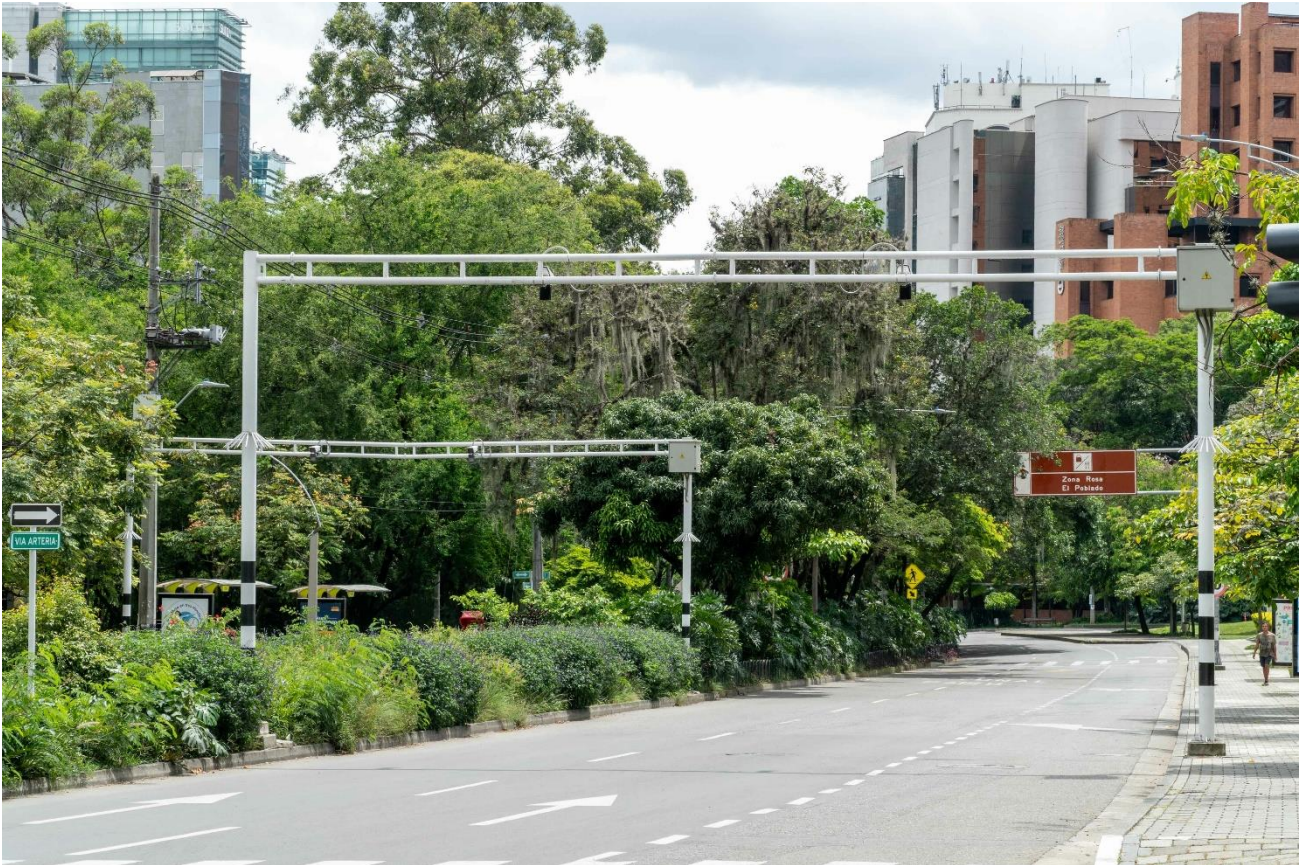
Medellin, Colombia, Poblado Avenue, a green corridor in the city.

PK: The inevitable and somewhat provocative question: would you say there is a value hierarchy between plants and animals with respect to their worthiness of moral consideration?