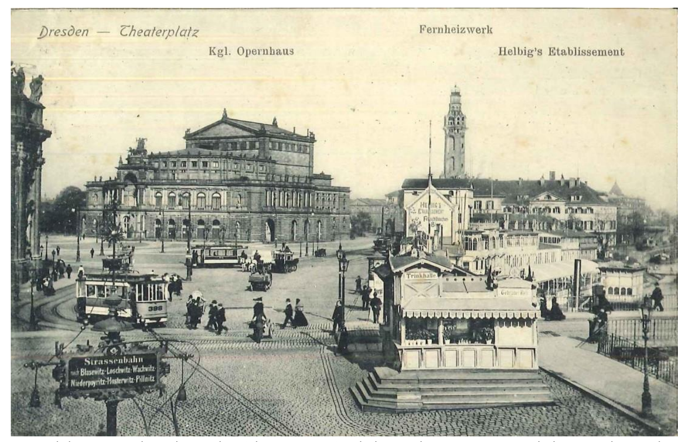
Postcard showing Dresden's Theaterplatz (Theatre Square) with the Royal District Heating and Electricity Plant on the right, 1908. All rights reserved.

chimneys . . . are so terribly insulting to this foreigners' paradise, pensioners' idyll, and dignified royal seat," were sure to have been pleased.