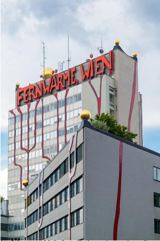
(Left) The Fernwärme Wien, a modern, operational example of the type of fully functional, yet also aesthetically incorporated, district power plant championed by Rietschel and the Assembly of Heating and Ventilation Professionals. (Right) The Fernwärme Wien central office.

It almost appears that the preoccupation with warmth made these gentlemen experts extremely conciliatory. As heated as discussions often were, Rietschel and his associates promoted the idea that their profession was a vocation based on empathy, cooperation, and moderation in competition. They were not just concerned with technology. Time and again, they emphasized the "intellectual work of the engineer," which was far more important than "pecuniary competition." An obsession with innovation, the "blind imitation of new phenomena, which currently often deteriorates to the