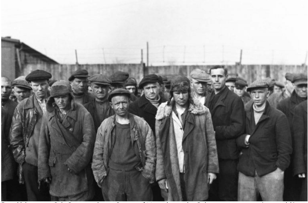
Forced laborers in a Ruhr District coal mine.

Oil is sexy. Coal, on the other hand, is boring. When we think of oil, we think of wars and military coups, dubious secret services, international corporations, global supply routes, inestimable wealth, and millionaires like the Rockefellers. Oil captures imaginations. Coal does not. No wars have been fought over coal and no fascinating industry leaders or giant corporations have been spawned by it. Coal conjures up dangerous work, not wealth. We associate it with ash and smoke and dirt. In a nutshell, it is unpleasant and dull.