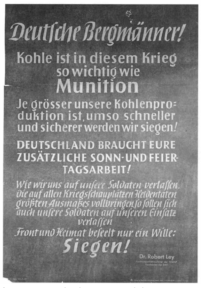
(Left) French poster with the message "Miner! The fate of France is in your hands." (Right) German poster asking miners to work on Sundays and national holidays to support the ongoing war.

This time, their efforts were successful. In France and Great Britain, mining became a nationalized industry. In West Germany, miners demanded the same. But there, nationalizing collieries would have created a huge and extremely powerful corporation—controlled by Germans. After their experience of the two world wars, Western allies were not prepared to allow this to happen. Instead, West German trade unions achieved an equal footing for workers and colliery owners, which significantly reduced the latter's influence. In the territories of the Soviet Union, a socialist planned economy prevailed. The result was as clear as it was surprising: the unassailable capitalist mining industry, which had led to considerable conflicts since industrialization and had poisoned the domestic policies of many states, no longer existed, or did so only in a controlled form.<sup>7</sup>