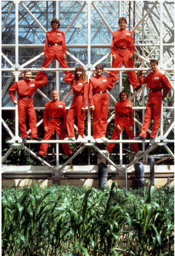
Lead image, Biospherians , 1991.

Consumption is totalizing and transformative. As humans consume, they eat the detritus of the technologies they have devised. They consume their own inventions, their own genius—literally. Pesticides, dioxins, glyphosate (Roundup), microplastics, antibiotics, cesium-137, and strontium-90 crowd into the corpus. No single body is pure. We have had a hard time seeing this obvious fact because one outcome of the twentieth century's cult of private property is a false impression that individual bodies are inviolable, discrete entities; that health, rather than a public affair, is a personal endeavor derived from one's lifestyle choices and genetic heritage. These ideas were useful because twentieth-century humans in the global north came to believe, as they consumed goods that poisoned the environments around them, that those with privilege and property could secure their well-being in controlled environments of dearly-purchased homeownership, automobiles, pension plans, and individualized health care. That myth shakes down, a tree shedding its leaves, as more and more people fall ill from "diseases of civilization."