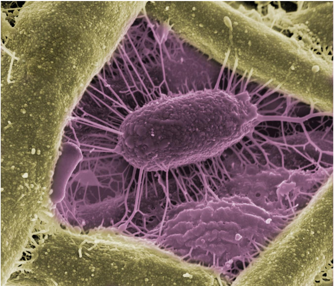
(Left) A microbe among Arabidopsis plant roots. Courtesy of Pacific Northwest National Laboratory . CC BY-NC-SA 2.0 . The image has been cropped. (Right) The exterior of Biosphere-2. Photo by CGP Grey . CC BY 2.0 .

Women, slaves, and the colonized subsequently fell into the same vegetal or animal taxonomies, categorized as dull and without feeling. Anthropologist Eduardo Viveiros de Castro describes this trend as the colonization of anthropocentric reasoning. 18 In time, European scientists looked to the plant world for inspiration and metaphors. They created a “tree of life,” a systematic way to exclude more humans and species as castaways from the escalator of progress. As social scientists fixed their understanding of “nature” into metaphors for living in the world, ideologies emerged to match them. 19 Darwin’s proselytizers viewed species as being in competition with each other for scarce resources, a conceptual turn that influenced business and political leaders to see “survival of the fittest” as a motto for enterprise and diplomacy. 20