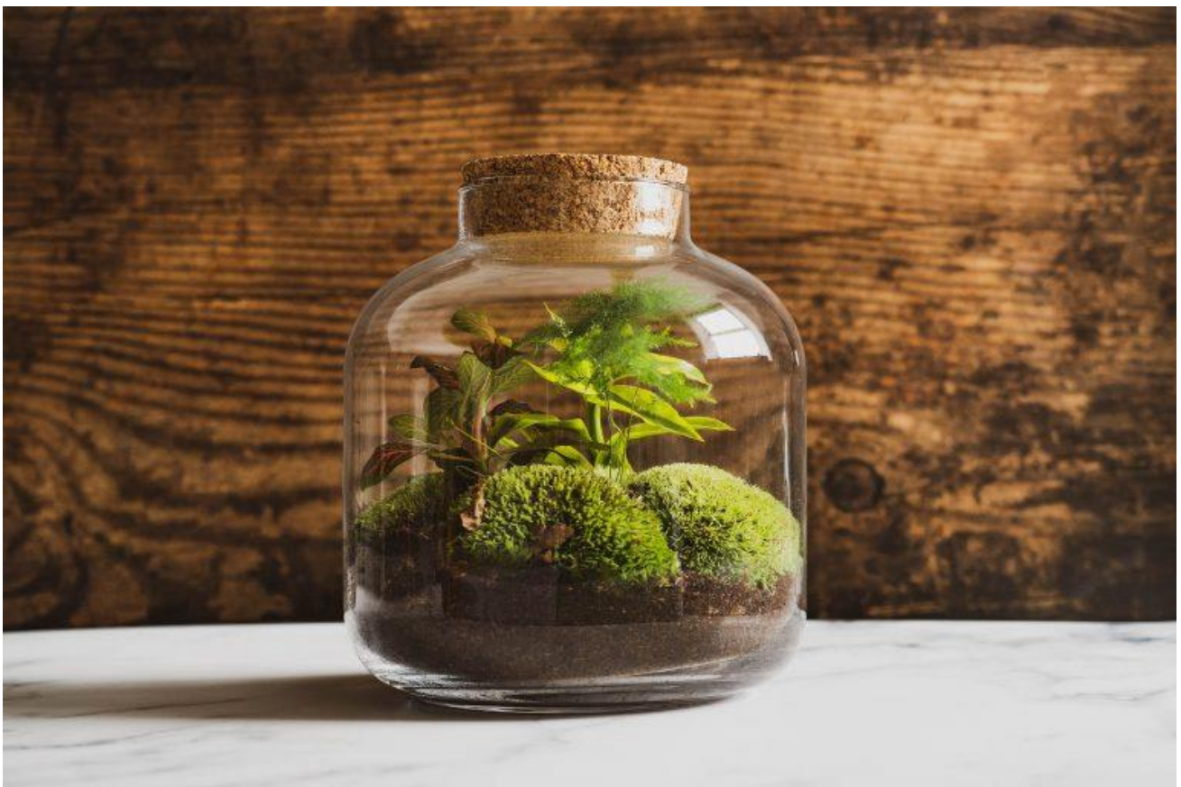
The image has been cropped.