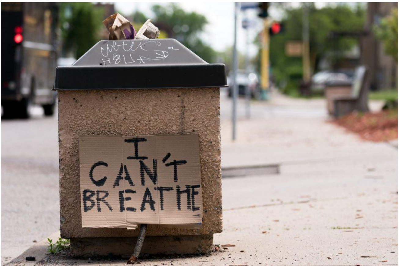
An “I Can’t Breathe” sign in Minneapolis, two days after the death of George Floyd.

Of late, in many ways we are reminded that breathing is a human being’s primary act. 16 And her last. Ross Gay’s poem points to how the act of breathing and of not suffocating is wrapped up in plants that give humans the oxygen we breathe and the worlds we inhabit. In fascinating ways, Cold War scientists came upon this insight as they imagined living on planets with no atmosphere. The Wardian cases designed to transport humans away from Earth led them back to a better understanding of Earth’s interwoven dependencies.