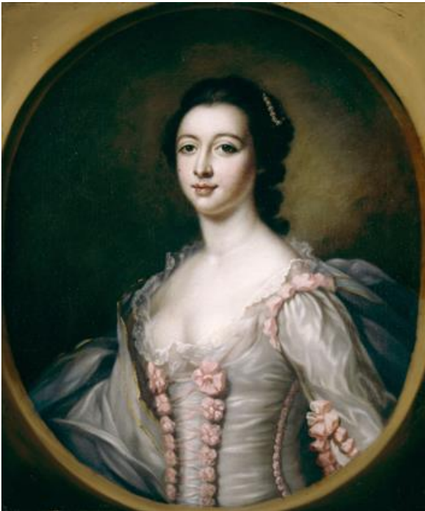
Francis Cotes, The Countess of Coventry , 1760.

This pigment's poisonous effects have been known since at least the Roman Empire. Pliny the Elder included lead white in his Natural History . 5 Despite this, it was only over the course of the twentieth century that its legal distribution in the West ended. 6 However, it is still sold on the global black market, including in European cities like Antwerp.