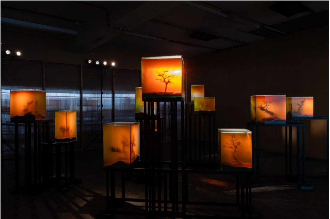
Various artists, toxiThropea.sunset , 2019, Deadly Affairs (23 March–30 June 2019), Kunsthal Extra City, Antwerp.