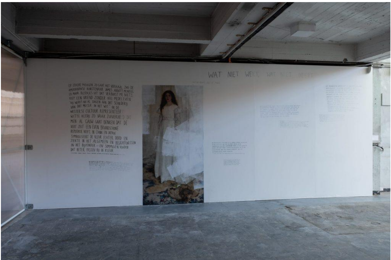
Adrien Tirtiaux, Toxic Tales , 2019, Deadly Affairs (23 March–30 June 2019), Kunsthall Extra City, Antwerp.

The initial effects of this poisonous substance matched historical beauty parameters in particular regions; it made women pale, ethereal, like some sort of supernatural (whiter than white) spirit.